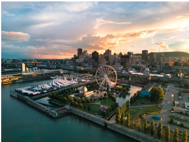
Old Port & Old Montreal

Sail the St. Lawrence, Discover Canada's Story.