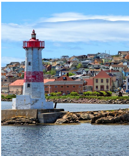
St. Pierre & Miquelon

Sail aboard Holland America's Volendam, your floating boutique hotel offering superb comfort, cuisine, and entertainment. With meals, guided tours, and thoughtful details handled for you, this journey lets you relax, connect with fellow travellers, and enjoy the adventure.