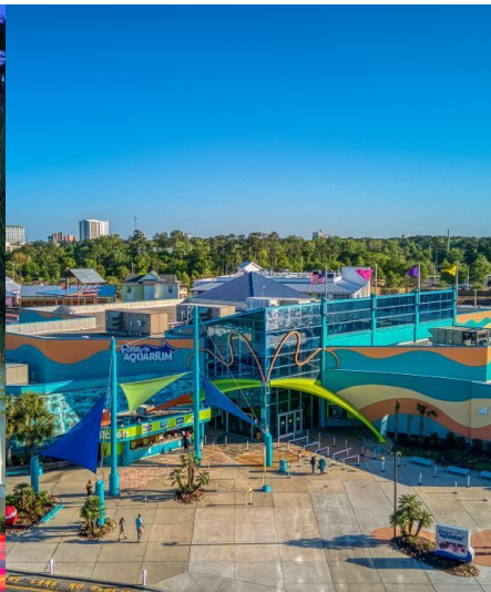
Ripley's Aquarium