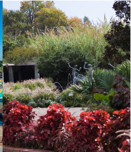
Brookgreen Gardens