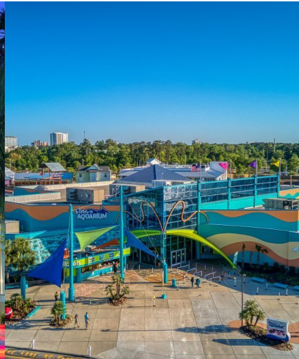
Ripley's Aquarium