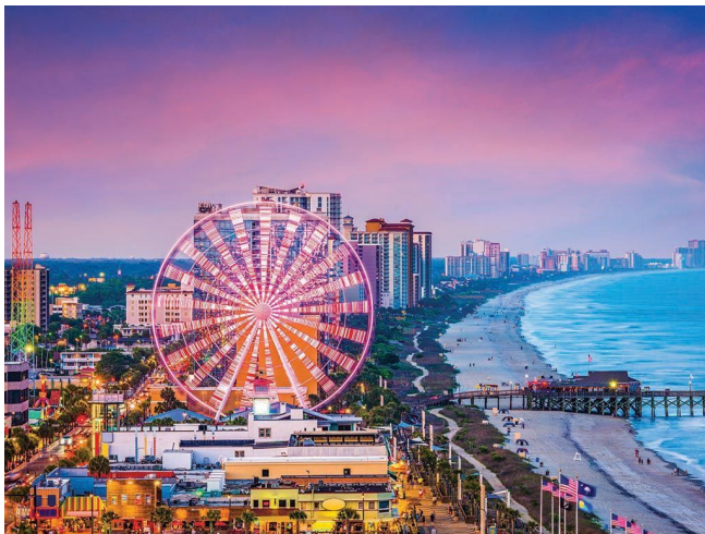
The Grand Strand

Welcome to "The Beach" – where happiness comes in waves!