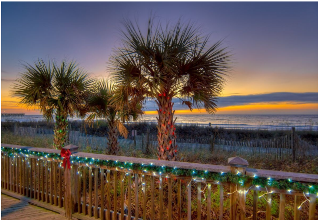
Myrtle Beach Boardwalk

Add a Dash of Sunshine to your Festive Cheer