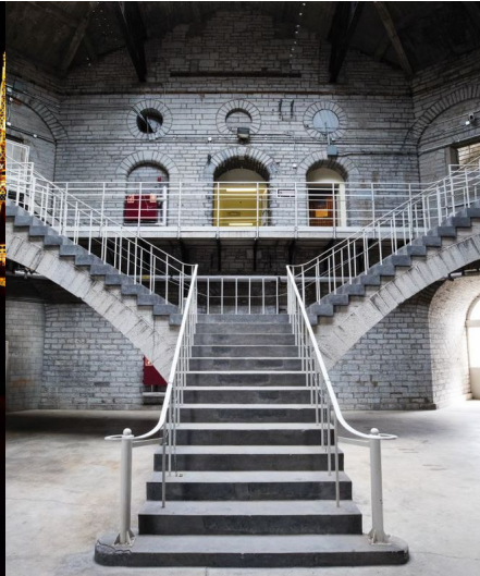
Kingston Penn