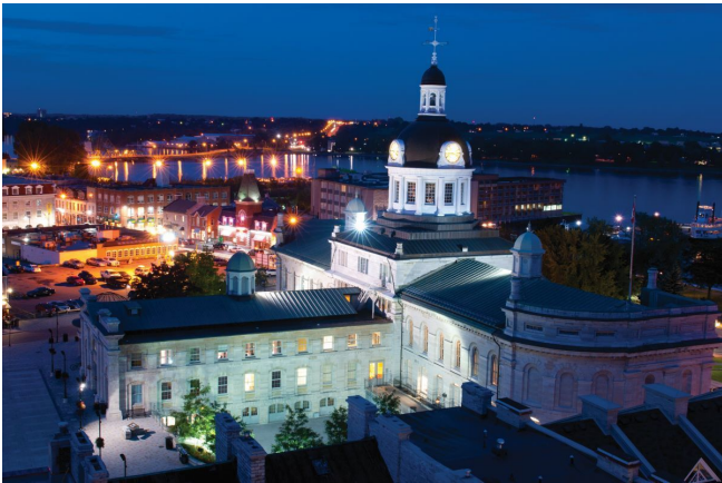
Kingston Waterfront

Fall Colours, Rich History, and a Thanksgiving to Remember