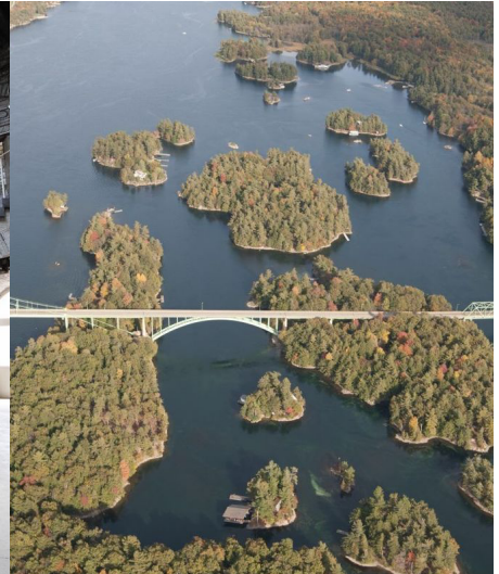
1000 Islands