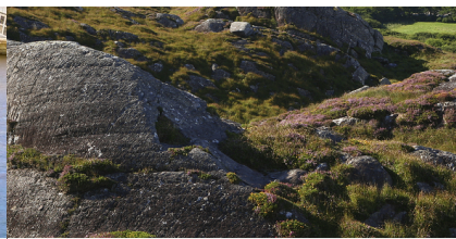
Ring of Kerry