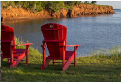
Skmaqñ-Port-la-Joye-Fort Amherst National Historic Site