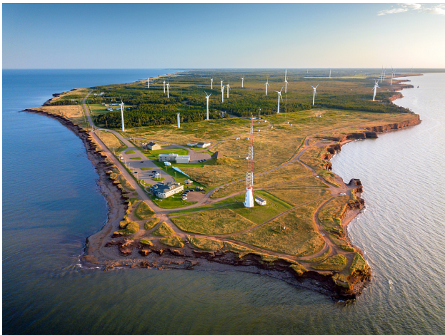
North Cape Complex & Wind Interpretive Centre

You never know what peace is until you walk on the shores or in the fields or along the winding red roads of Prince Edward Island..." - Lucy Maud Montgomery