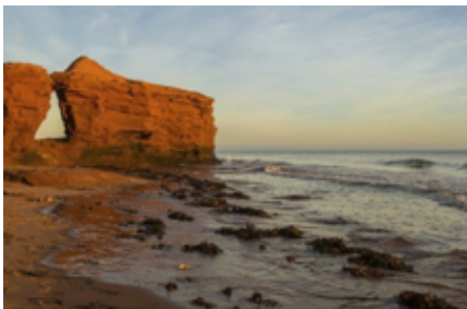
Red Beaches of PEI