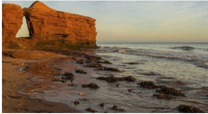
Red Beaches of PEI