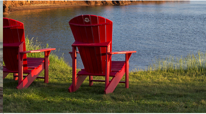
Skmaqn-Port-la-Joye-Fort Amherst National Historic Site