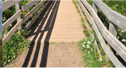
PEI Greenwich National Park Boardwalk