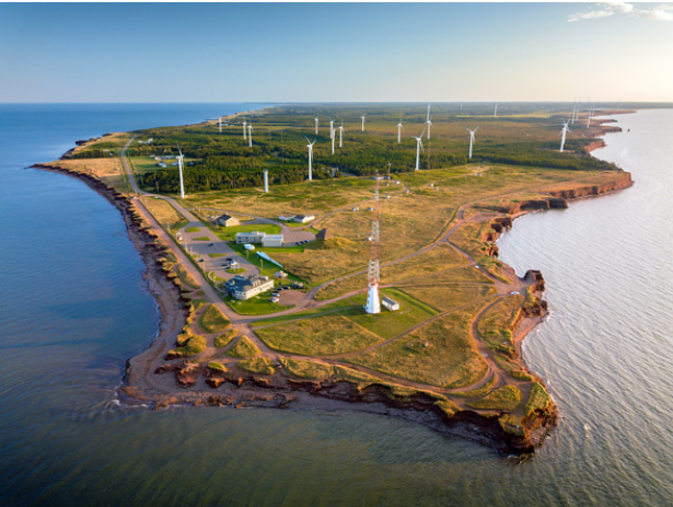
North Cape Complex & Wind Interpretive Centre

You never know what peace is until you walk on the shores or in the fields or along the winding red roads of Prince Edward Island...” - Lucy Maud Montgomery