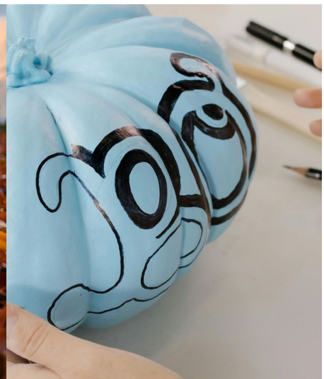
Sip n Paint