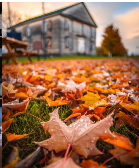
Fall in Prince Edward County