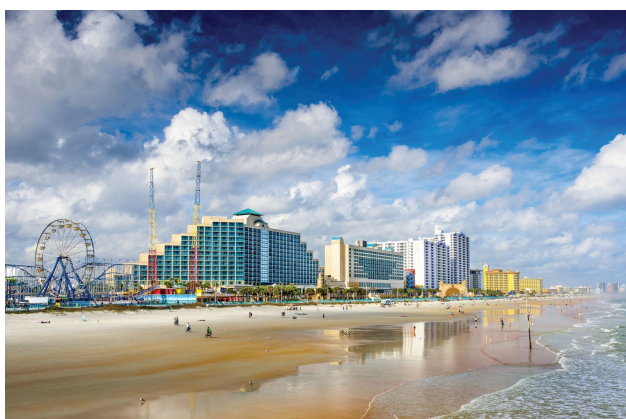
Daytona Beach Boardwalk Region

Relax on "The World's Most Famous Beach."