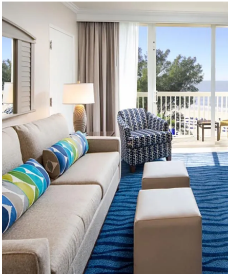
Gulf Front Villa with Balcony

Note that selecting a room type does NOT specify the building in which the room is located.