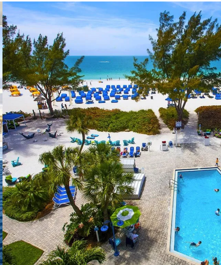
Gulf Front Pool