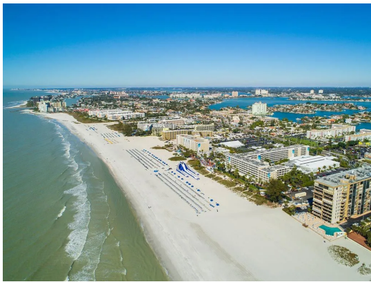
St. Pete Beach Aerial View