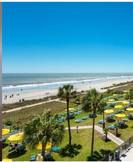
Pool and Beach View