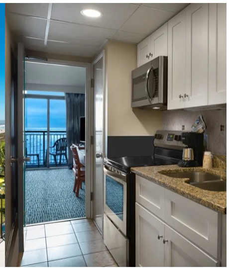
Oceanfront Efficiency Kitchen