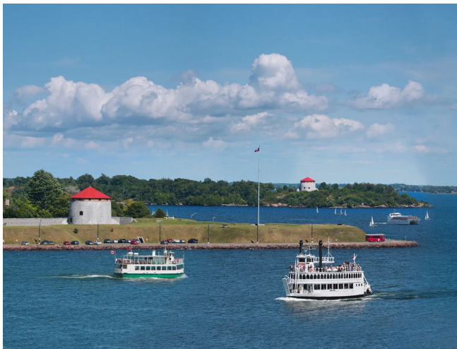
Kingston Waterfront