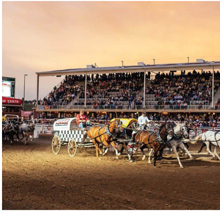
Chuck Wagon Races