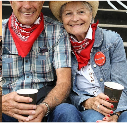
Enjoying the Stampede