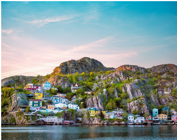
St. John's

A Seamless Journey Through Scenic Shores and Charming Cities