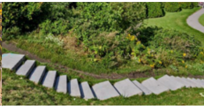
Québec City