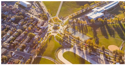
Aerial of Halifax