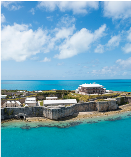
Royal Naval Dockyard

We take care of the details of getting you to the cruise port and home again, with fun exploring in between!