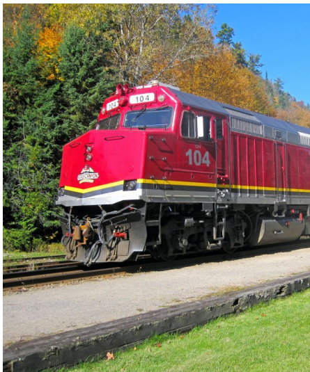
The Agawa Canyon train

Bring your friends and enjoy the fall colours together, even if one person would prefer not to take the train ride. On that day, in the comfort of the coach, enjoy one of the most scenic drives in Ontario!