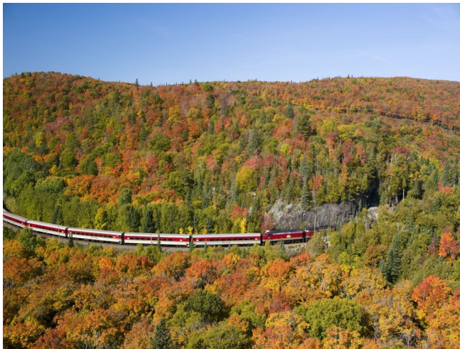
Agawa Canyon Train

Fall Colours with a Canadian Signature Experience!