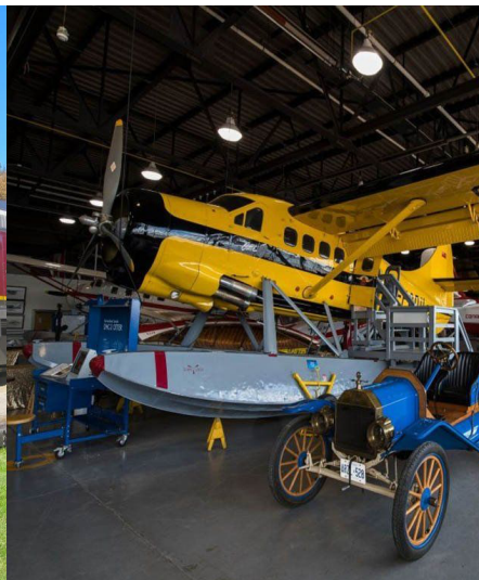
Canadian Bushplane Heritage Centre