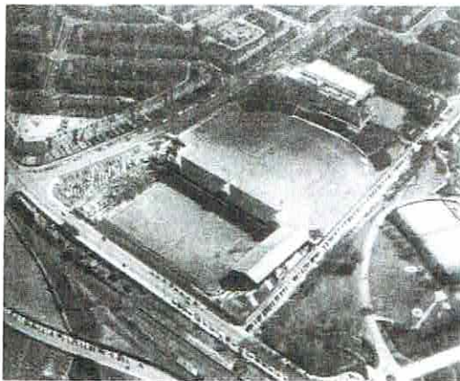
Bradford Park Avenue in its heyday with cricket and football twinned