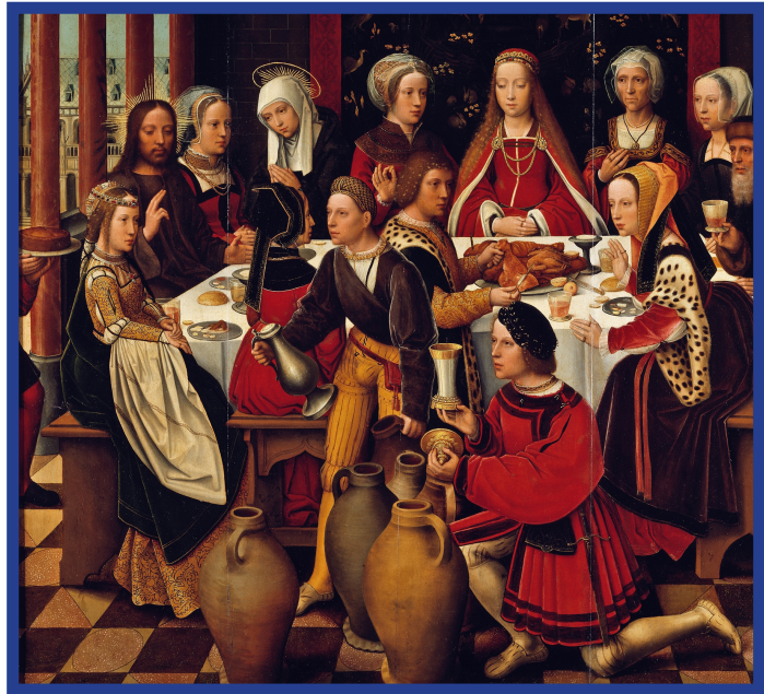
“The Wedding in Cana” Benson

to the servants, 'Fill the jars with water,' and they filled them to the brim. Then he said to them, 'Draw some out now and take it to the master of the feast.' They did this, and the master tasted the water turned into wine. Having no idea where it came from—though the servants who had drawn the water knew—the master of the feast called the bridegroom and said, 'Everyone serves the good wine first and then the worse wine when the guests are well wined; but you have kept the best wine till now.'