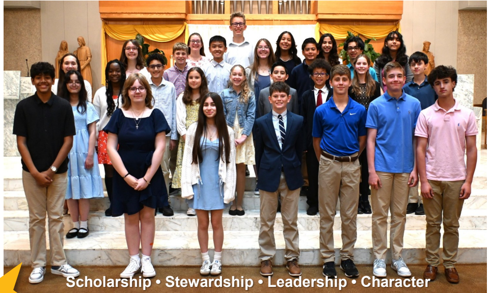
Scholarship • Stewardship • Leadership • Character

We are sending a special congratulations to the St. Thomas More School National Junior Honor Society on welcoming its newest members during an induction ceremony held on May 19. Membership in NJHS recognizes students who exemplify the organization's core values of Scholarship, Stewardship, Leadership, and Character. These students have demonstrated a commitment to academic excellence, service to others, leadership within our school community and strong moral character. We are proud of these outstanding students and congratulate them on this well-deserved achievement.