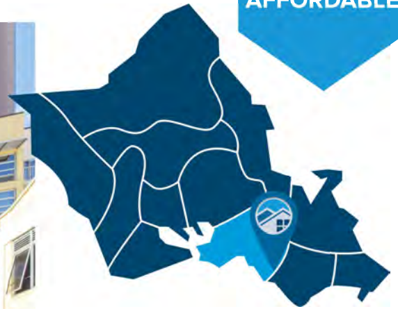
HONOLULU METRO KAKAAKO