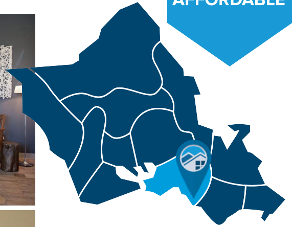
HONOLULU METRO KAKA'AOKO