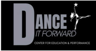
Photo Shoot Day

Please use this link to sign up now for the Photo Shoot on Sat, May 16. https://www.signupgenius.com/go/5080B4BA9AC2BA64-63307687-photo#/