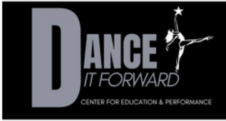
Photo Shoot Day Saturday, May 16, 2026 - See schedule below

Please use this link to sign up now for the Photo Shoot on Sat, May 16. https://www.signupgenius.com/go/5080B4BA9AC2BA64-63307687-photo#/