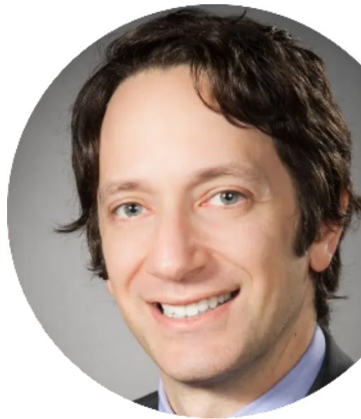
CO-FOUNDER & CMO