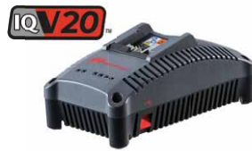
IQV20 Series 20V Battery Charger BC1124-EU