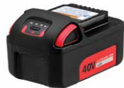
IQV40 Series 40V, 2.5Ah Lithium Ion Battery Pack BL4011