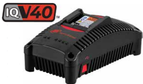
IQV40 Series 40V, 2.5Ah Battery Charger BC1161-EU