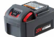
IQV20 Series 20V, 5.0Ahr Lithium Ion Battery Pack BL2022