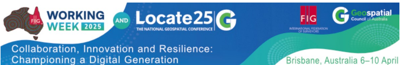
FIG Working Week 2025 is being held from 6 - 10 April 2025 at the Brisbane Convention & Exhibition Centre (BCEC), Australia. The overall theme for the Working Week 2025 is: Collaboration, Innovation and Resilience: Championing a Digital Generation . More information can be found at, Invitation to FIG Working Week 2025 in Brisbane, Australia