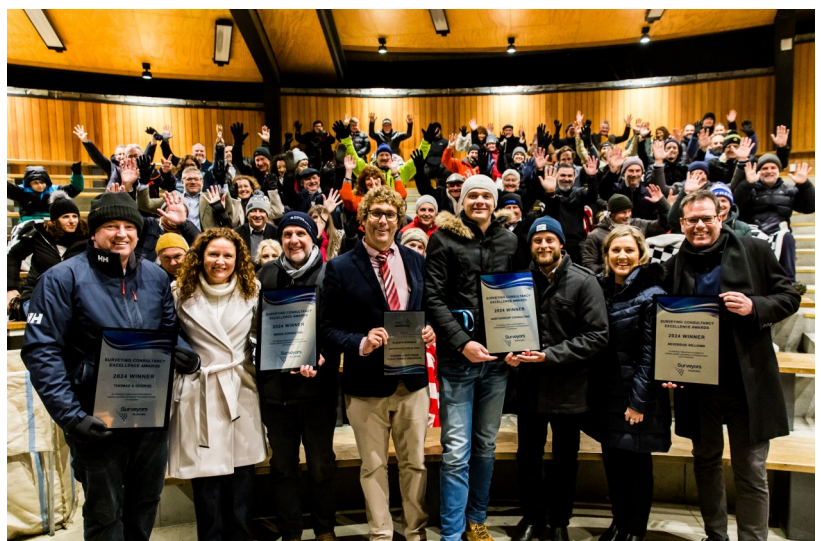
2024 National Award Winners