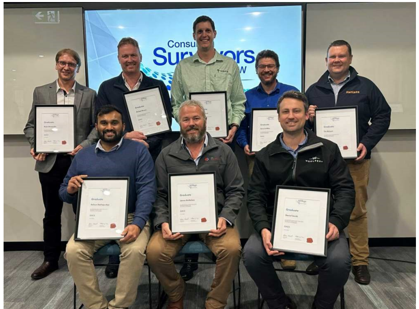
Business Academy graduates from NSW