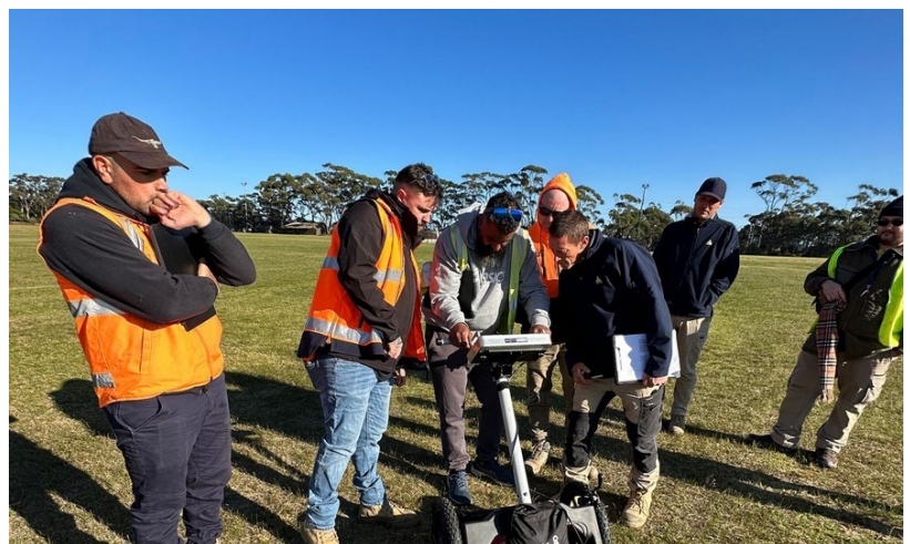
Surveyors Australia students in the field