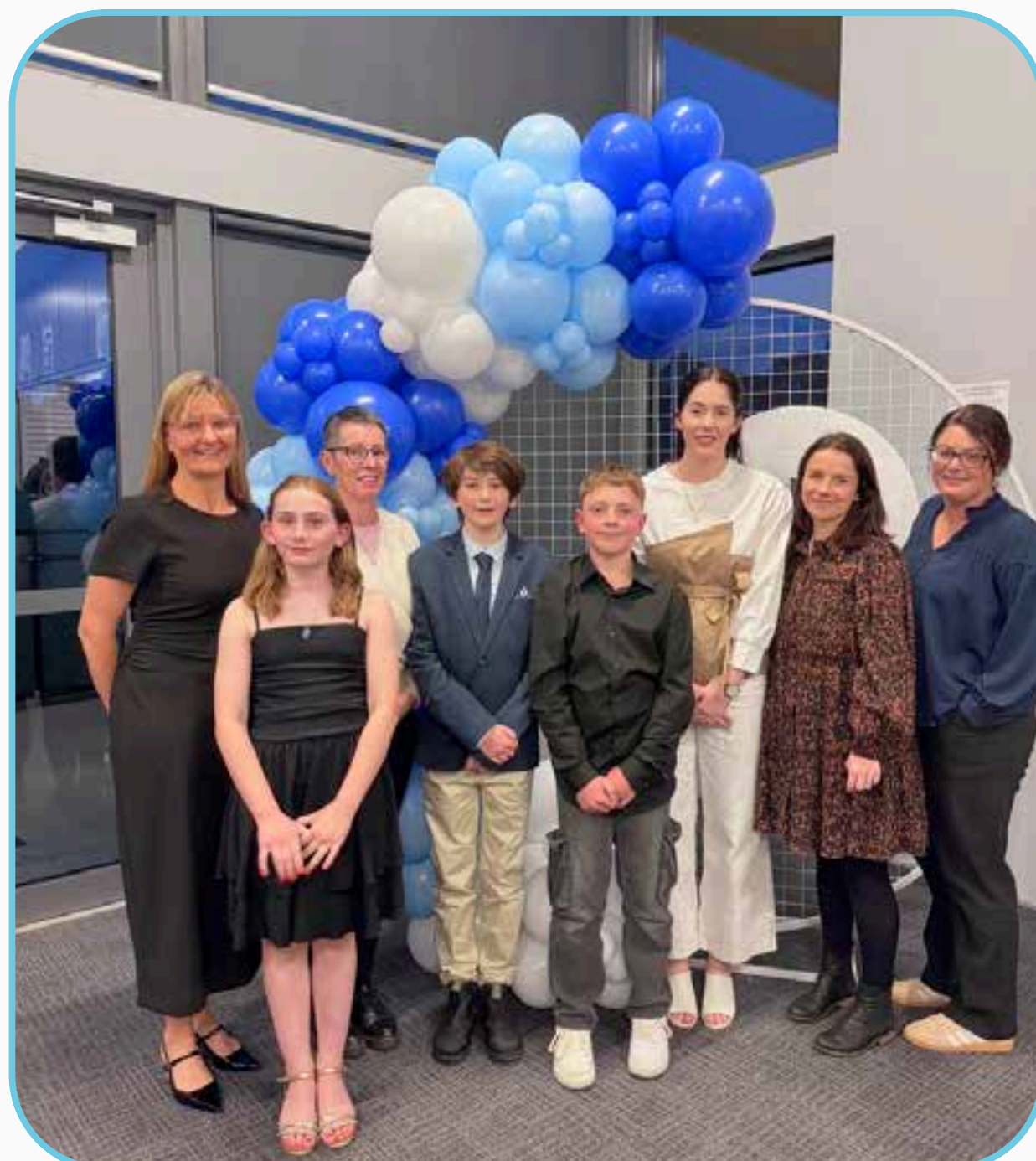
Pyrenees Cluster Graduation Dinner at Lexton Hub - Congratulations to our Year 6 students!