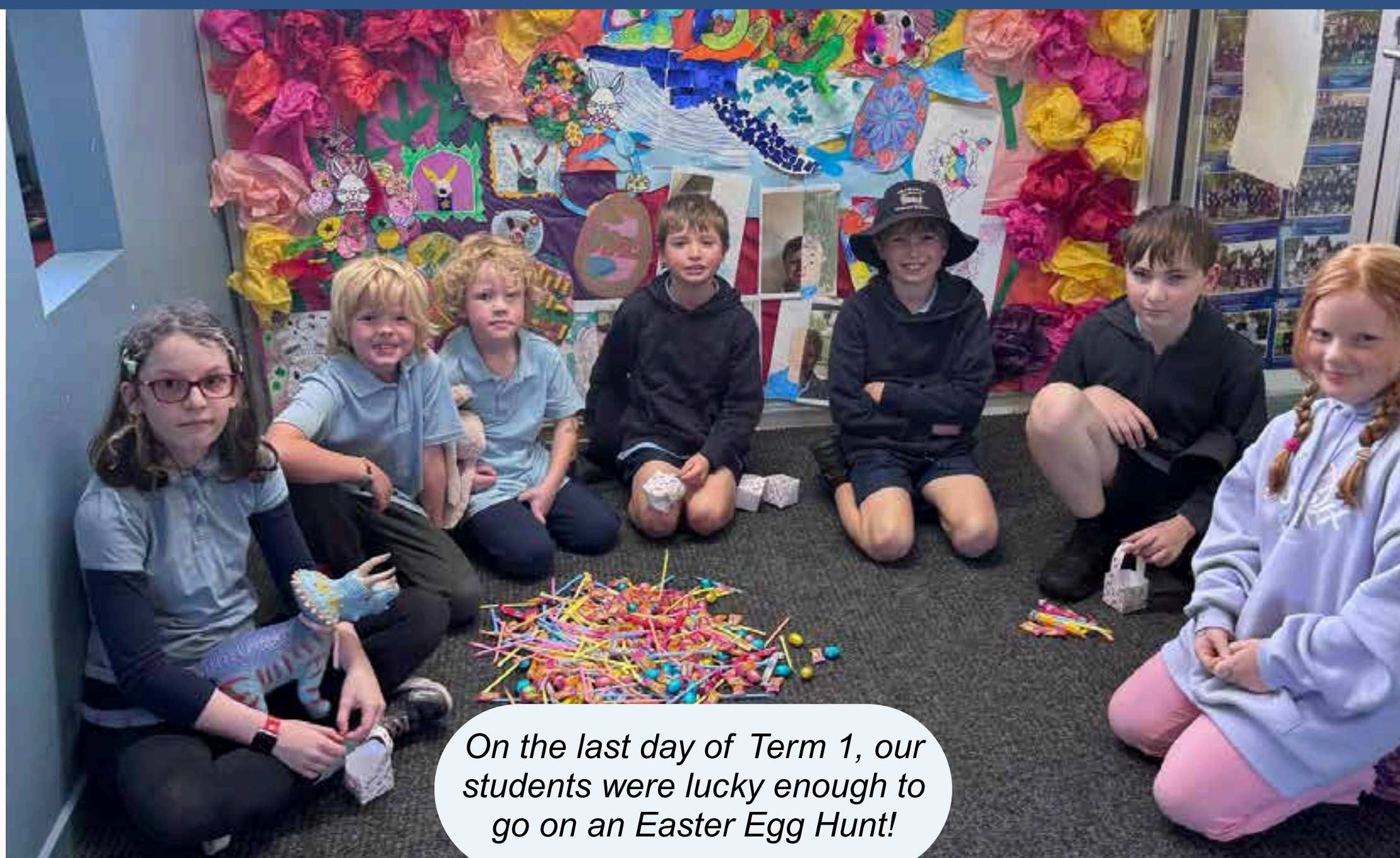
On the last day of Term 1, our students were lucky enough to go on an Easter Egg Hunt!