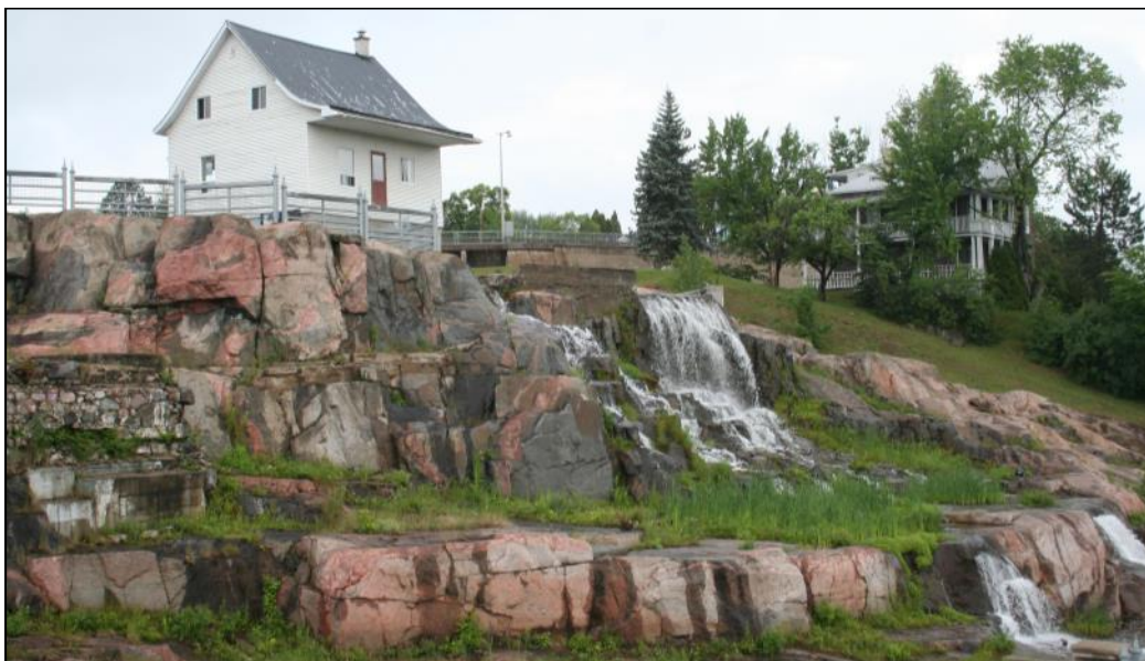
The Little White House in Chicoutimi, now a museum, and a rare survivor of the July 1996 flood.