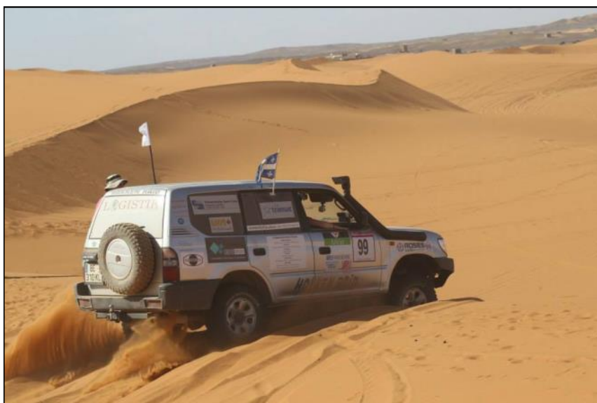
Our vehicle Rose-Air in the Moroccan desert.

attend school instead of being forced into a premature marriage.