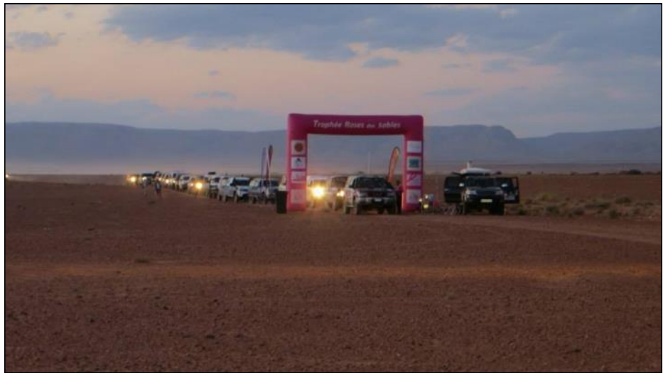
Arrival of the Roses at the first bivouac near Erfoud in southern Morocco.