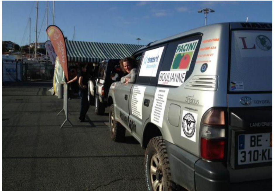
Waiting to go through the checking point in Ciboure, a small town in southern France.

During our second day, we drove to Ciboure , a small town in the south of France, close to the Spanish border, where the rally was officially starting. On the way we did a small detour to Toulouse to pick up the many kilos of goods collected by another Rose (name given to the participant). As you may know, we had to bring fifty kilos of goods as gifts for the Desert Children Association ( Enfant du desert ).