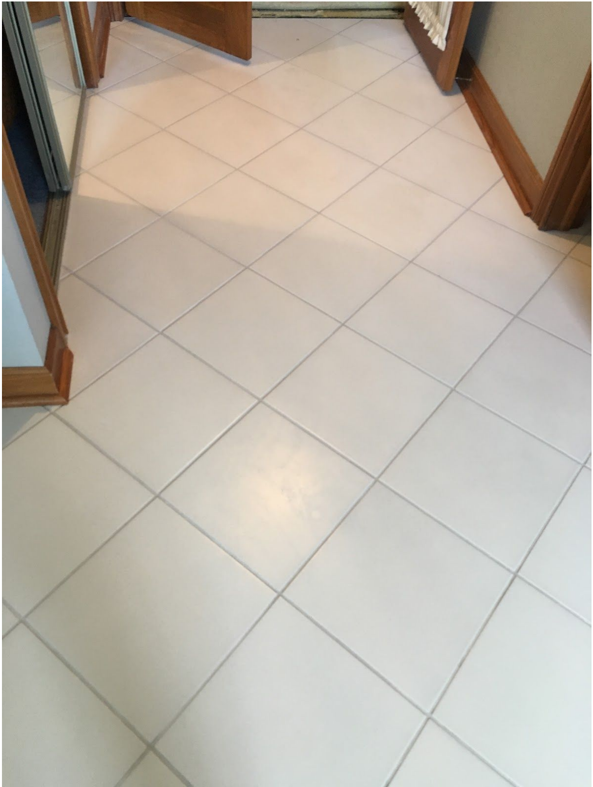
Installation: Hardwood Nail-Down Location: Kitchen, Living room, and bedrooms