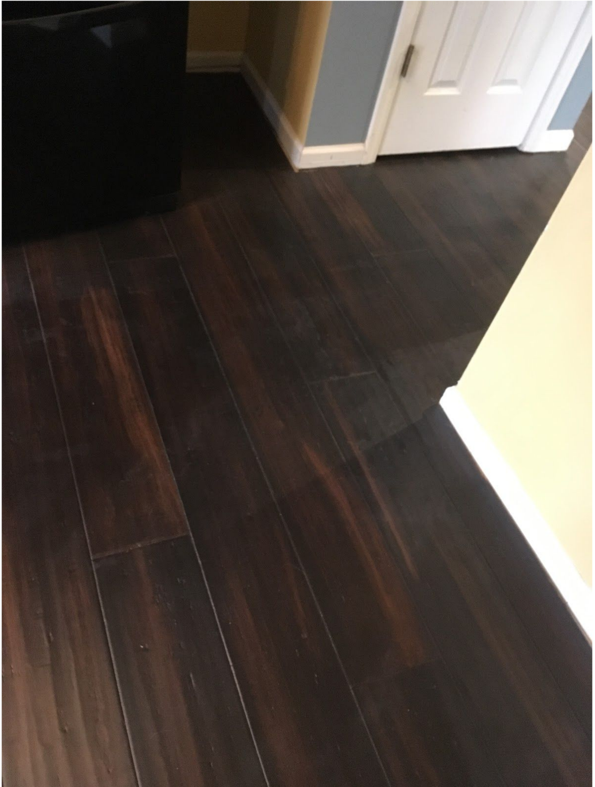
Installation: Laminate Locking Floor. Location: Living room, and hallways.