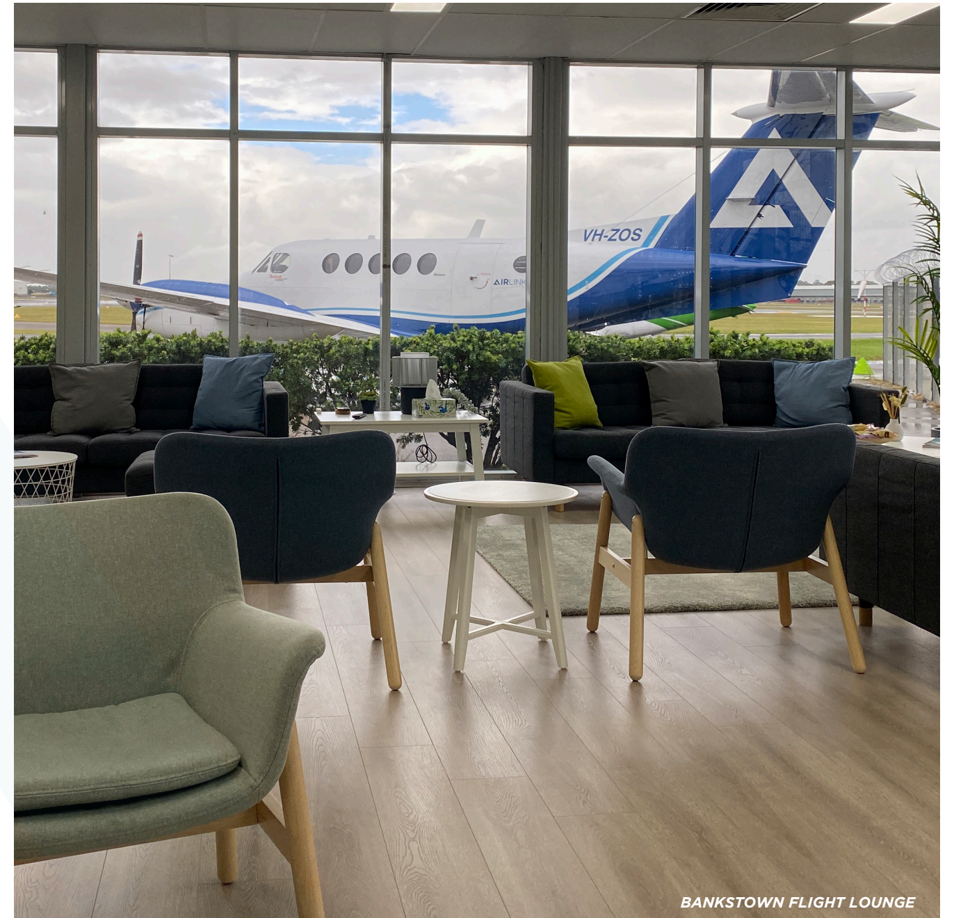
BANKSTOWN FLIGHT LOUNGE