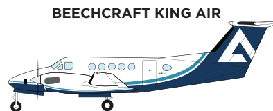
BEECHCRAFT KING AIR

Private Jet 5 Passengers Air Conditioned Pressurised