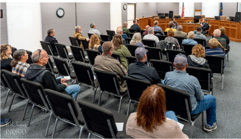
Photos taken at our November Coffee with the County event, featuring Congressman Marlin Stutzman.

By joining this nationwide effort, the LaGrange County Chamber reaffirmed its commitment to advocating for a stable business environment and the well-being of our community.