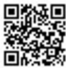
Scan to register and pay