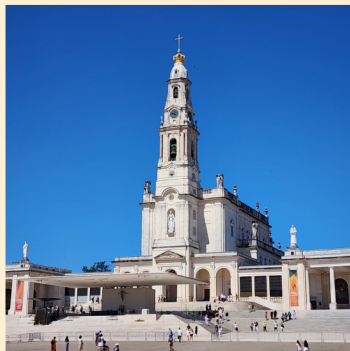
View of the Basilica of Our Lady of the Rosary