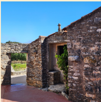
The home of Jacinta and Francisco still stands today in Fatima.

Fatima has since become one of the most significant pilgrimage sites in the world, drawing millions each year. The story continues to inspire devotion, reflection, and a sense of hope for peace. Many people see the message of Fatima as a timeless call to faith, compassion, and personal transformation.