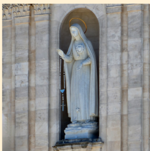
This statue of Mary was donated by the United States in 1958 to adorn the outside of the basilica