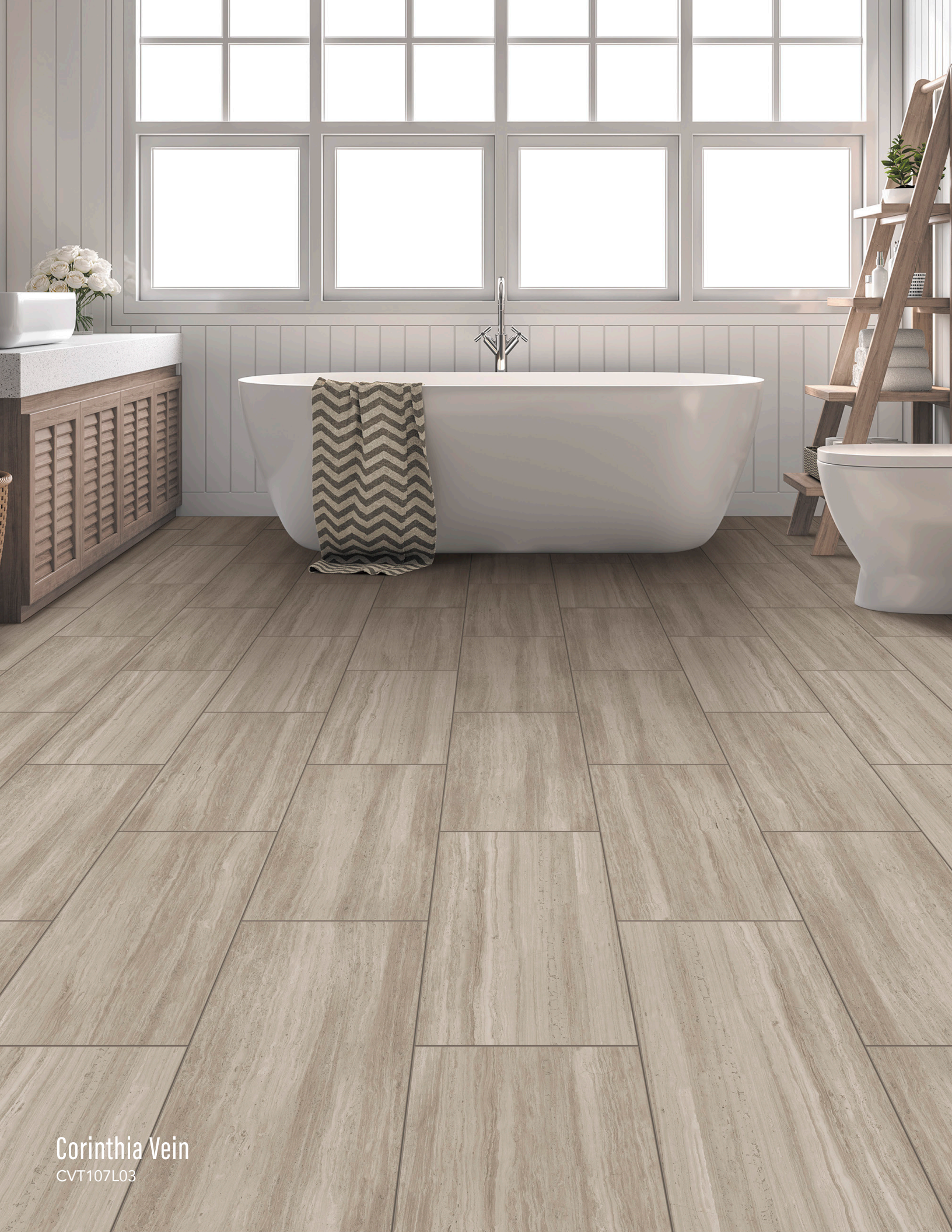
Corinthia Vein CVT107L03