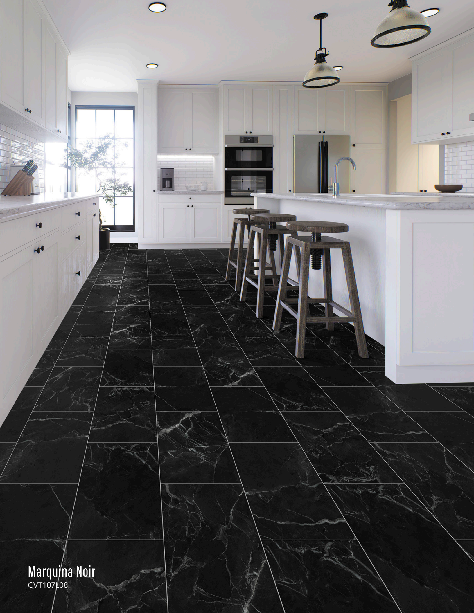
Marquina Noir CVT107L08