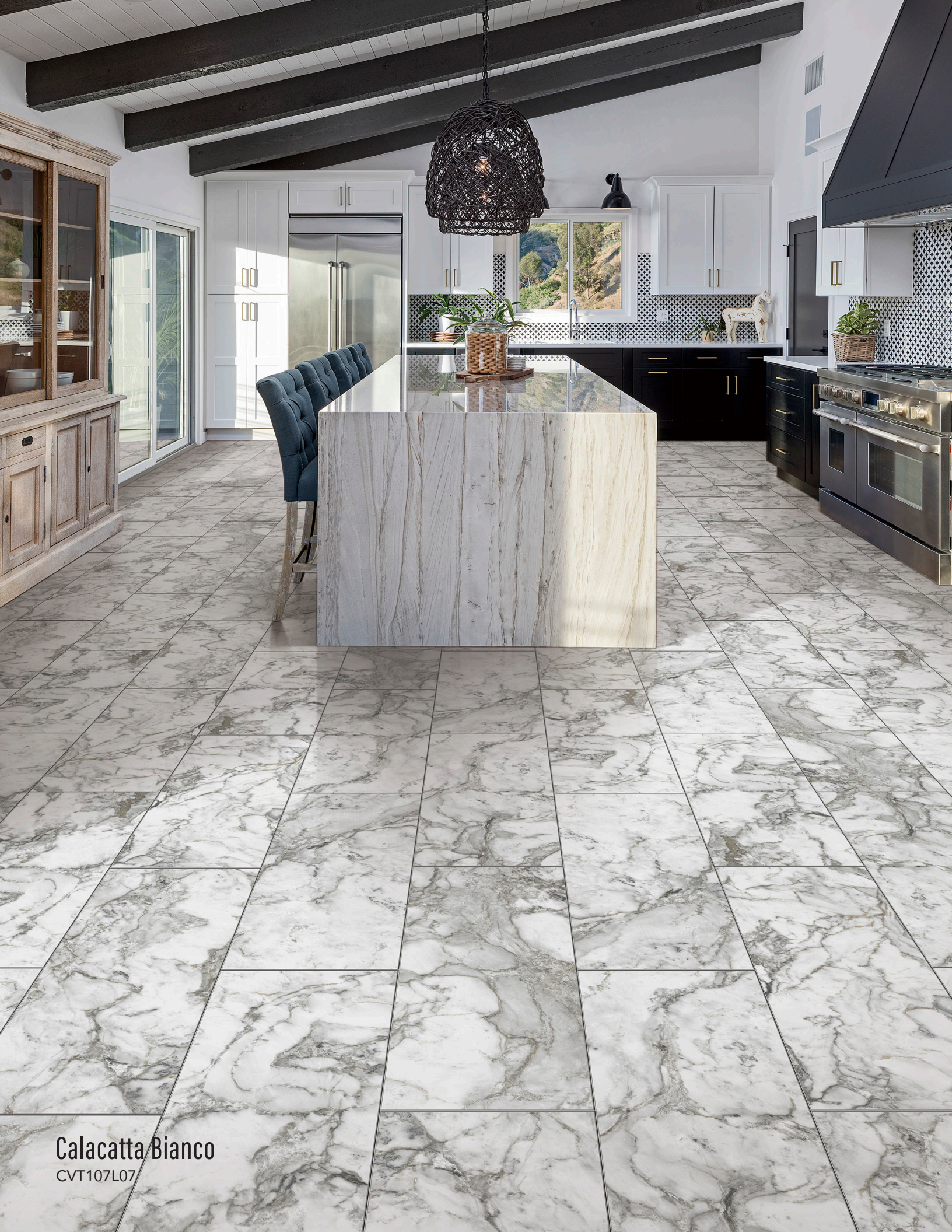
Calacatta Bianco CVT107L07