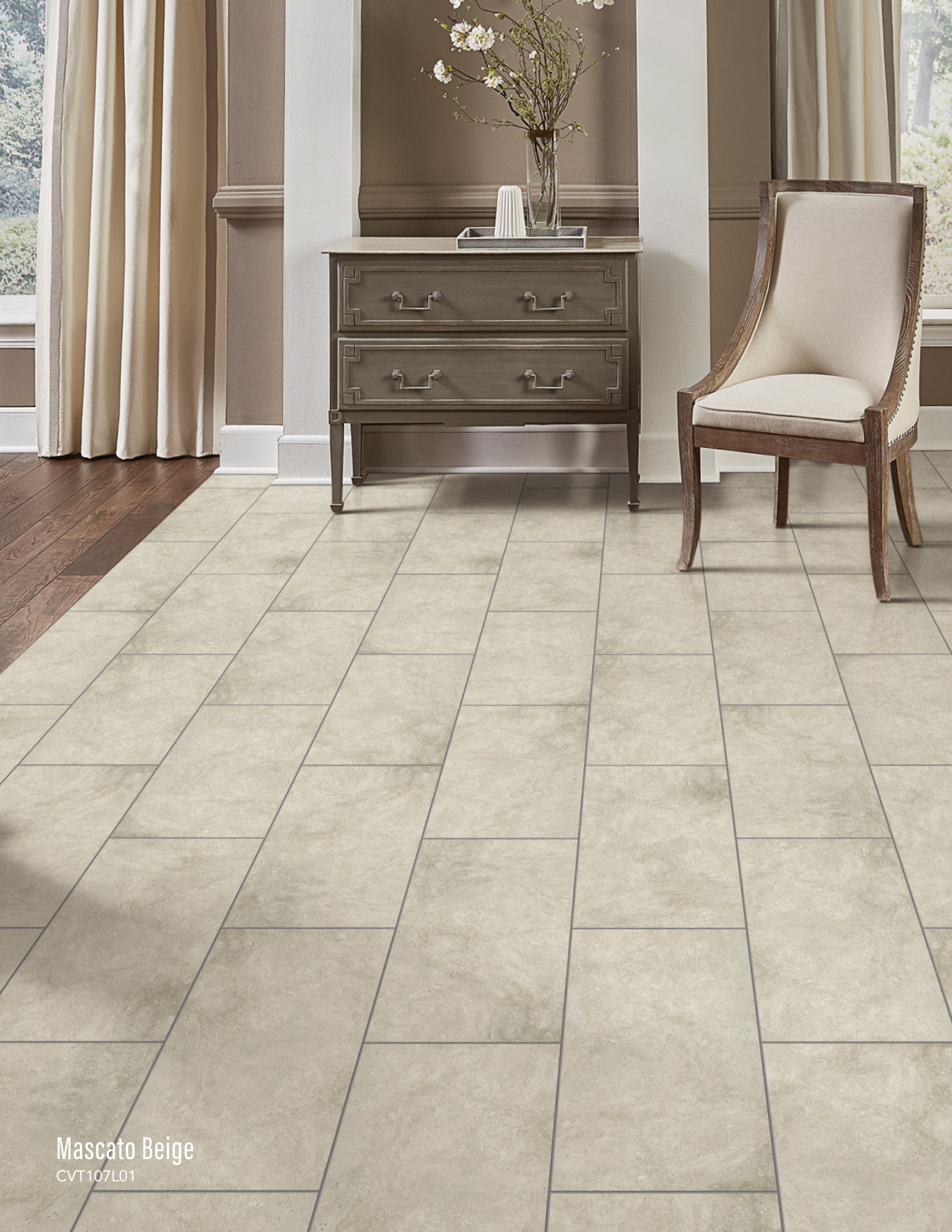
Mascato Beige CVT107L01