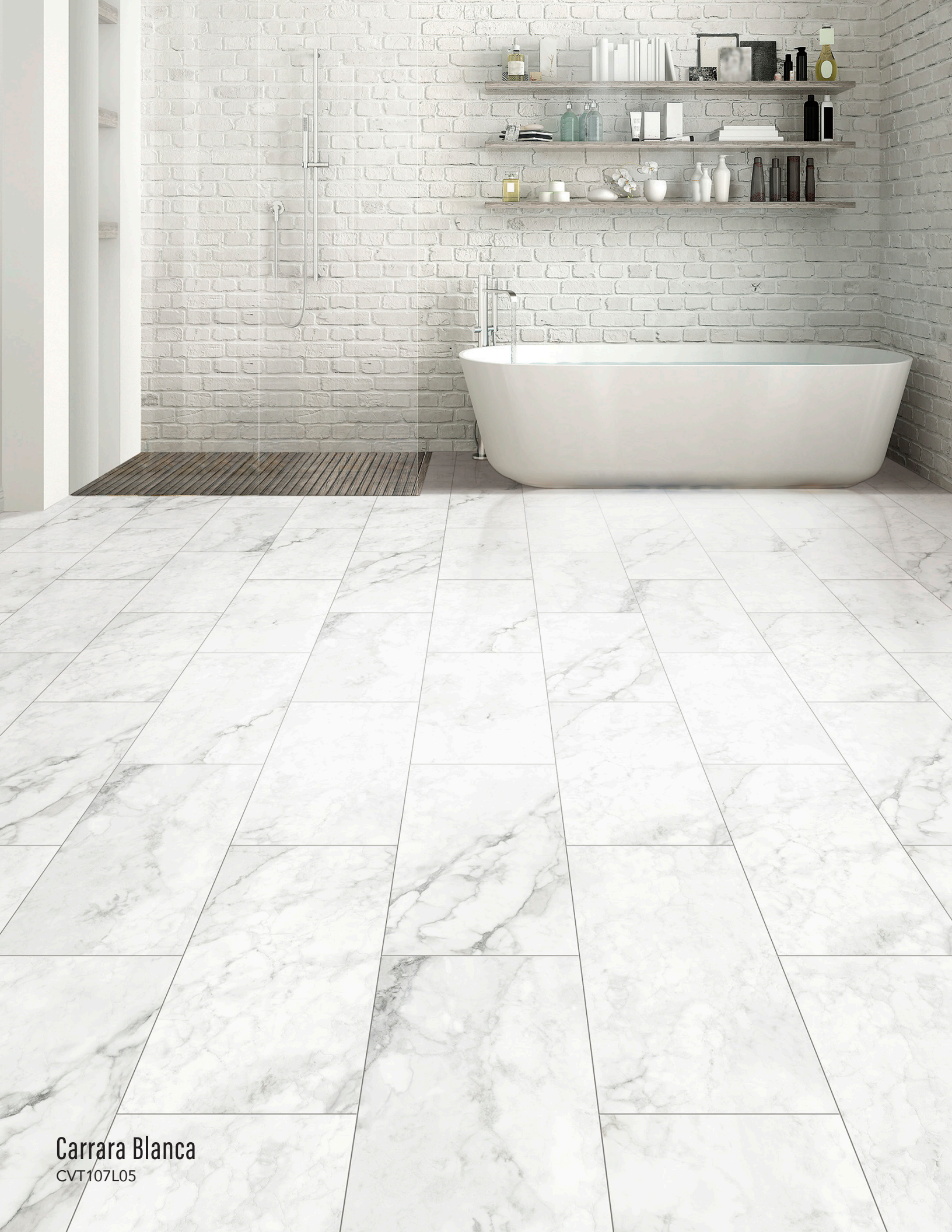
Carrara Blanca CVT107L05