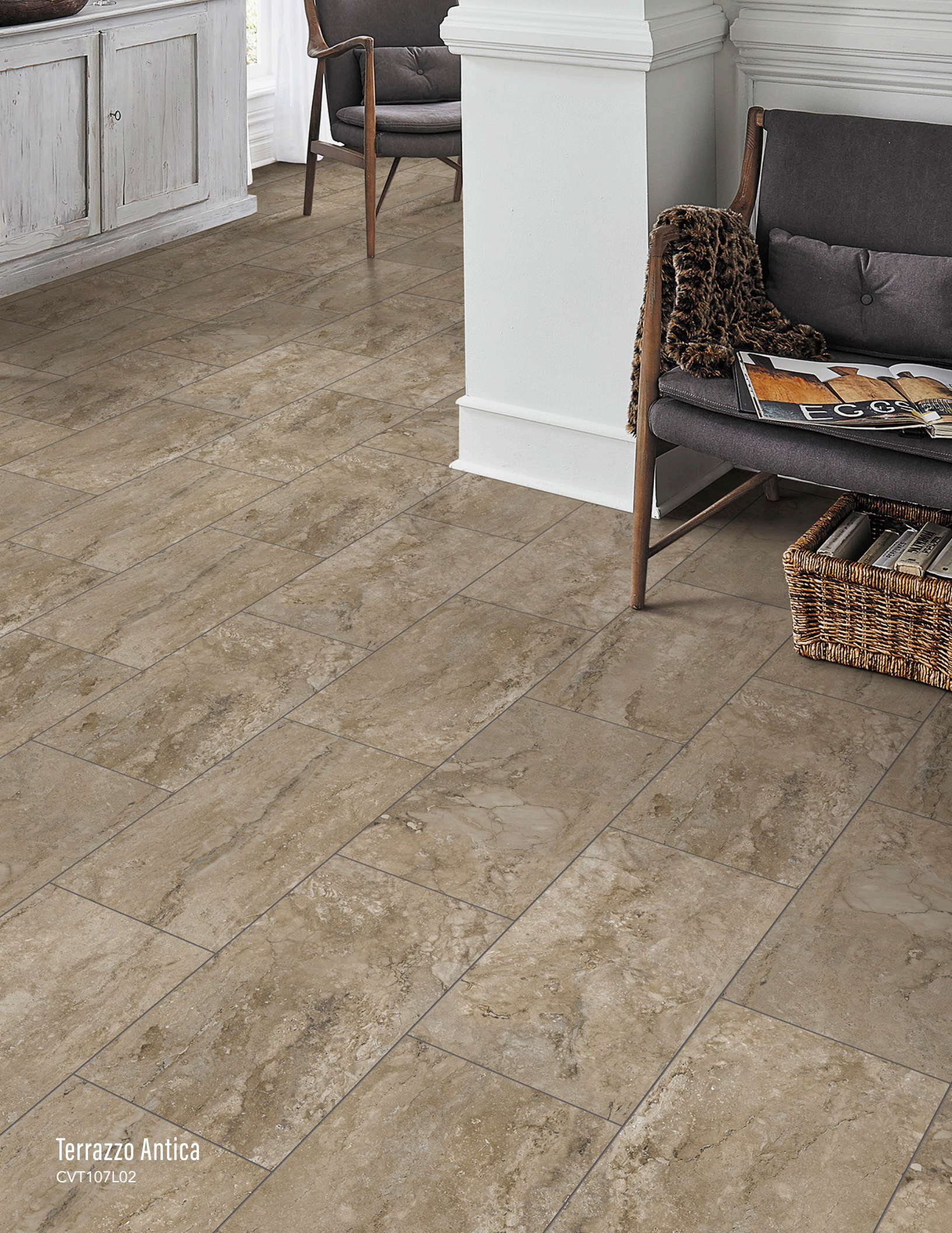
Terrazzo Antica CVT107L02