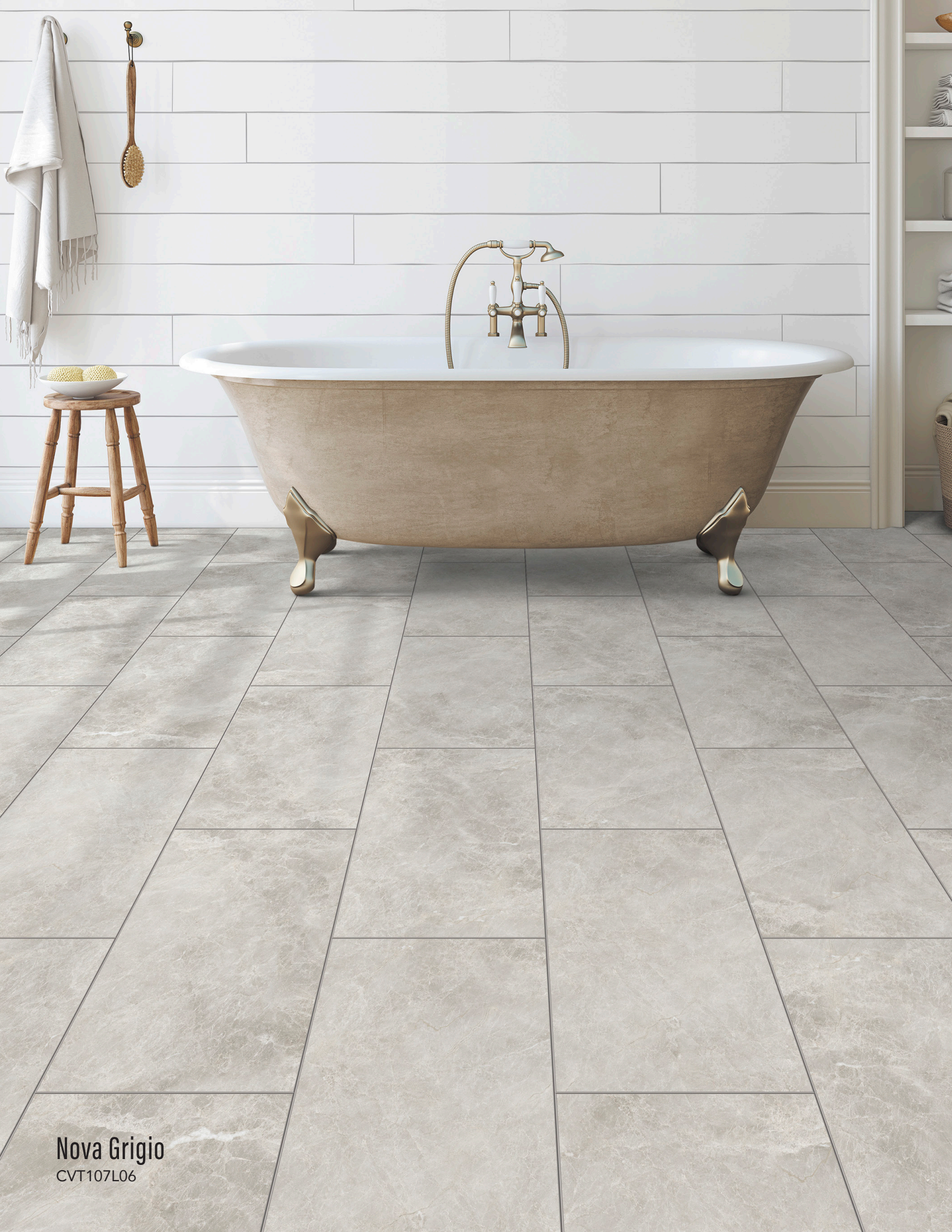
Nova Grigio CVT107L06