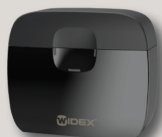
Charge n Clean

Updated Phone & Accessory Options Available!