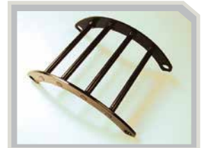
* optional bar grate

REDUCE YOUR GREEN WASTE COSTS, SAVE WATER AND TURN YOUR GREEN WASTE INTO QUALITY GARDEN MULCH.