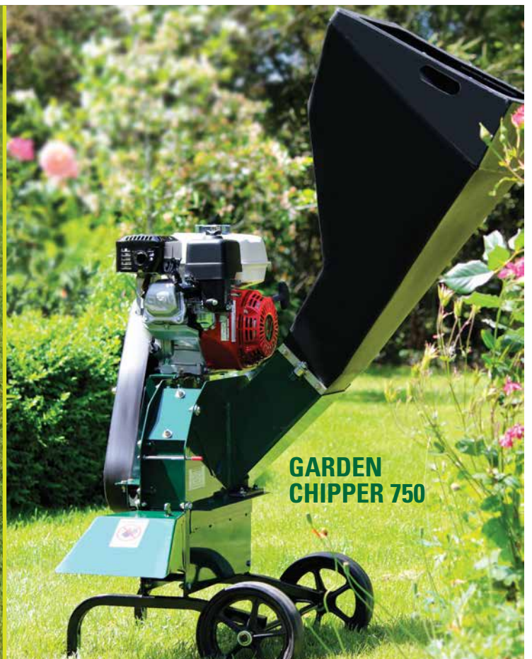
GARDEN CHIPPER 750