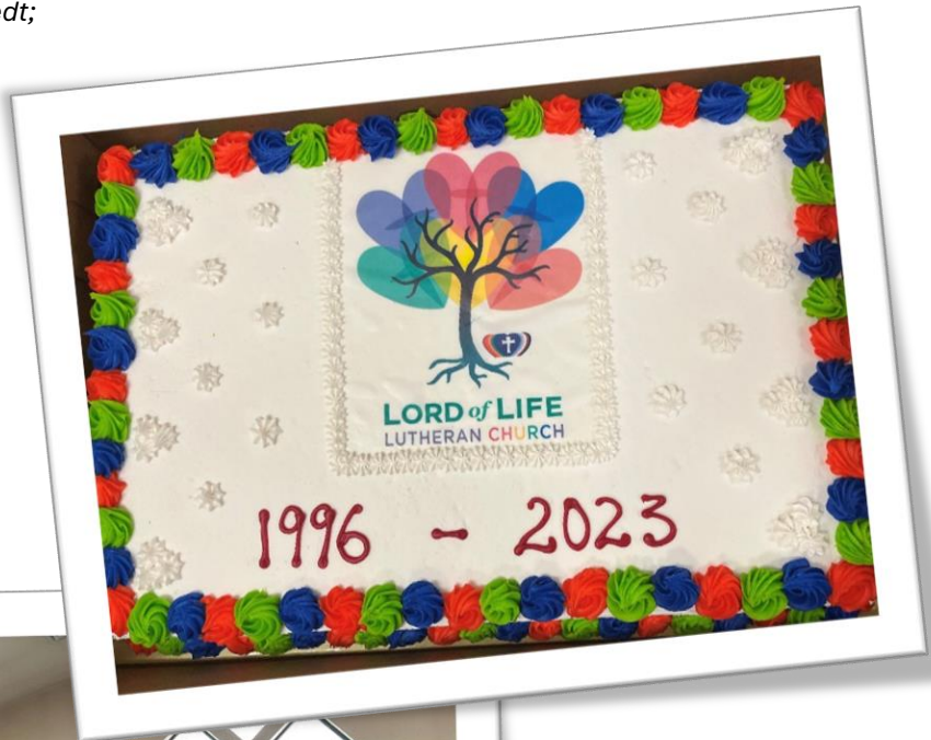
celebratory cake enjoyed during the fellowship following the final worship gathering of LoLLC.