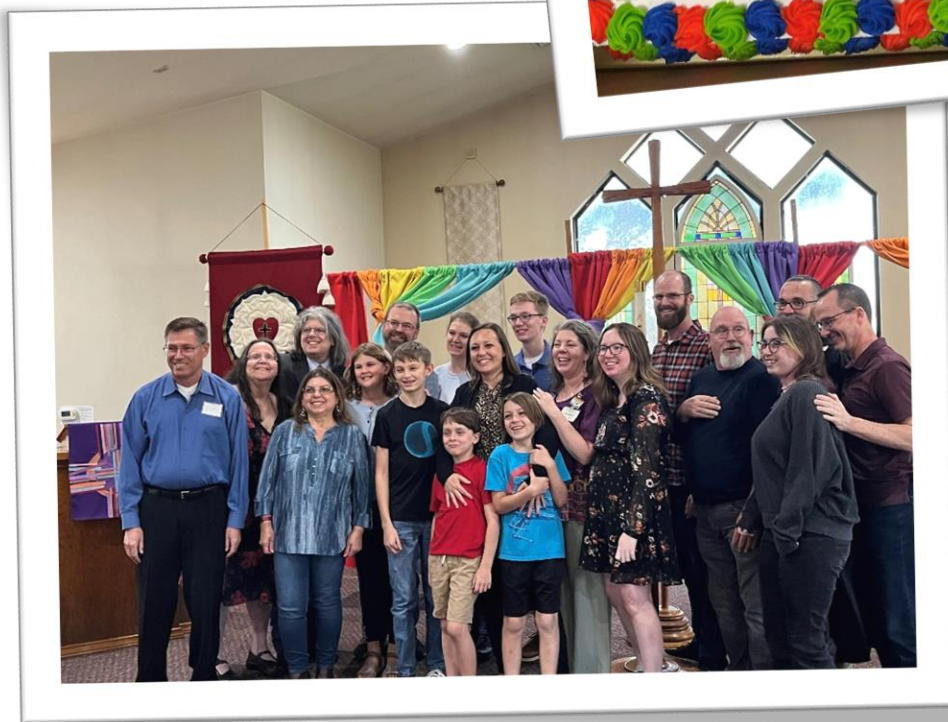
the community of Lord of Life Lutheran Church, 5Mar2023.