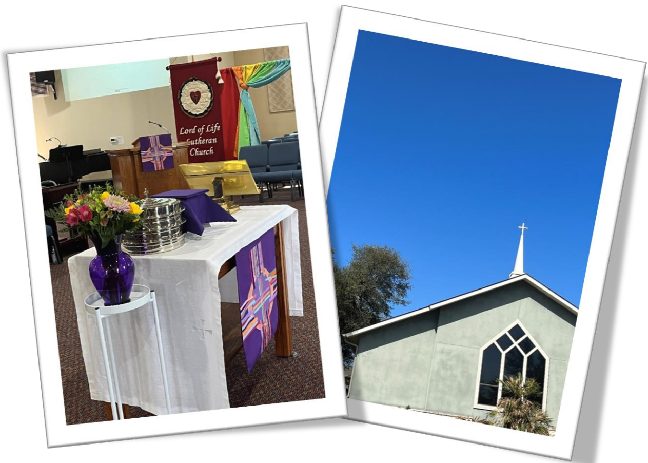
[left] Lord of Life's altar, ready to serve the community meal as a reminder of our collective forgiveness from sin through Christ and our togetherness in this celebration; [right] the front façade of the building that housed the community of Lord of Life Lutheran Church since 2006.

The support received from Lord of Life has been vital in amplifying our mission and impact. Thank you for inviting us to be stewards of the Lord of Life Legacy. It is an honor to serve children and families across Texas and your support is an essential part of our progress.