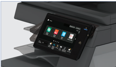
Pivoting touchscreen adjusts instantly for the perfect viewing angle.