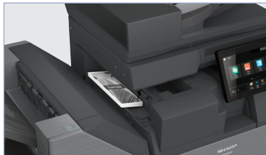
Inner Folding Unit option offers a variety of fold patterns, including c-fold, z-fold and others.