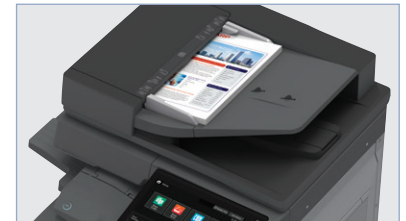
100-sheet RSPF scans documents at up to 80 images per minute.