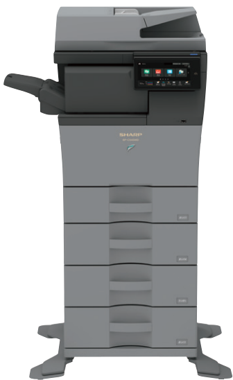
BP-C545WD shown with Inner Finishing Unit in a 4-drawer configuration.