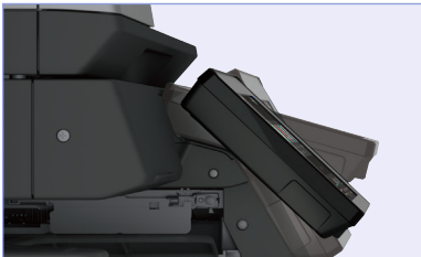
Pivoting Touchscreen offers the viewing angle for any use instantly.