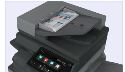
100-sheet RSPF scans documents at up to 80 images per minute.