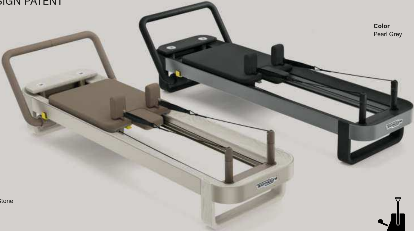
Color Sand Stone