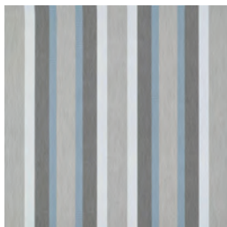
Marco Blue Grey