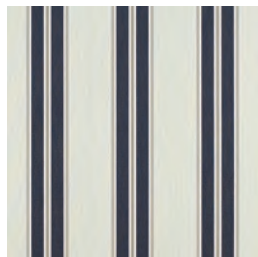
Navy Taupe Fancy