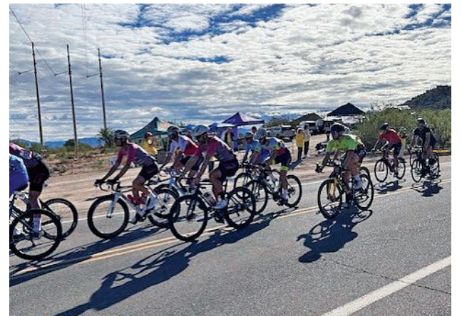
LEAD RACERS pass Aid Station #7 on Mission Road.