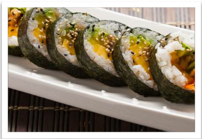
Actual dish might look slightly different than the photo