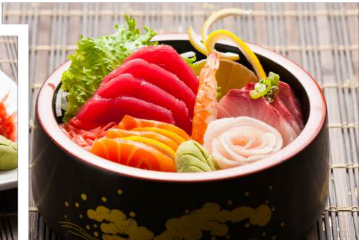
Actual dish might look slightly different than the photo