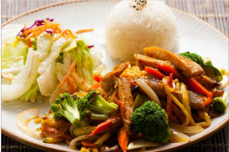
Actual dish might look slightly different than the photo

BEFORE PLACING ORDER, PLEASE INFORM YOUR SERVER IF A PERSON IN YOUR PARTY HAS A FOOD ALLERGY