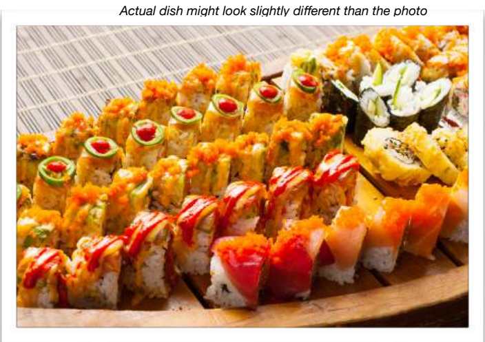
Actual dish might look slightly different than the photo

WE USE ALL MAJOR ALLERGENS IN OUR KITCHEN, SO WE CANNOT GUARANTEE THAT OUR FOOD IS COMPLETELY FREE OF ANY ALLERGEN. IF YOU HAVE A SEVERE ALLERGY, WE RECOMMEND NOT ORDERING FROM OUR RESTAURANT