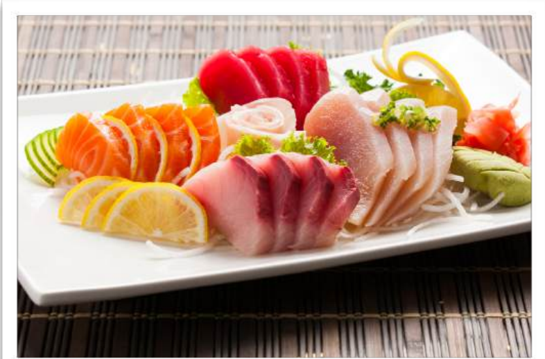
Actual dish might look slightly different than the photo