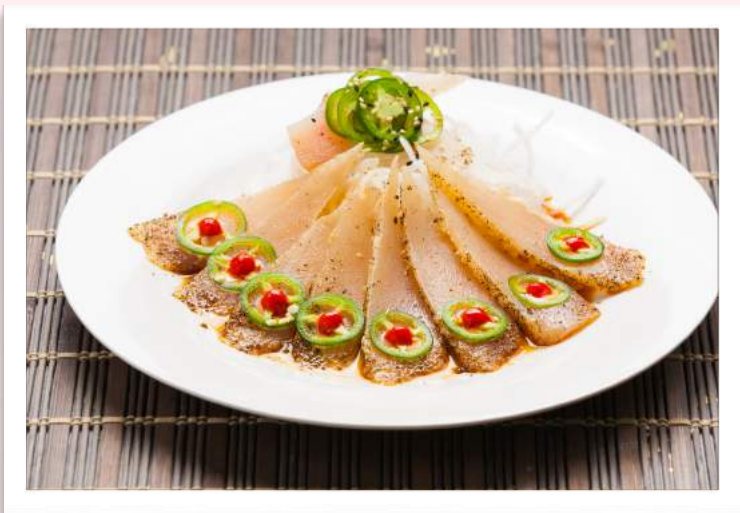
Actual dish might look slightly different than the photo

SOFT SHELL CRAB.....$10.95 FRIED BREADED SOFT SHELL CRAB