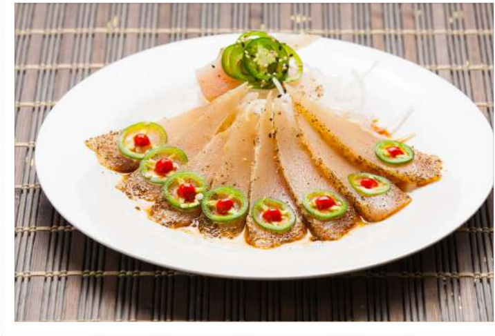
Actual dish might look slightly different than the photo