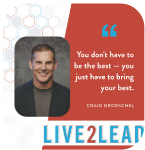
CRAIG GROESCHEL Host of the Craig Groeschel Leadership Podcast and Pastor of Life.Church

Live2Lead is an annual leadership gathering developed by Maxwell Leadership. Marking its 11th anniversary this year, Live2Lead has shared leadership and personal growth principles to live audiences and over 300 simulcast locations around the world.