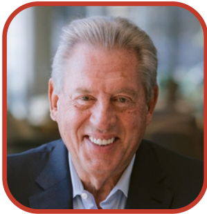
JOHN C. MAXWELL #1 Leadership Expert and Best-Selling Author

Example from 2024 (2025 speakers will be released in August)