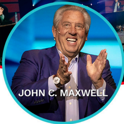
JOHN C. MAXWELL