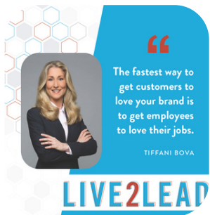
TIFFANY BOVA Global growth evangelist and author of The Experience Mindset

Attendees learn from renowned leadership experts in various industries, gain new perspectives on relevant topics, and leave prepared with practical tools to maximize their leadership abilities and trajectories. Our attendees leave equipped and excited to lead and create change with renewed passion and drive.